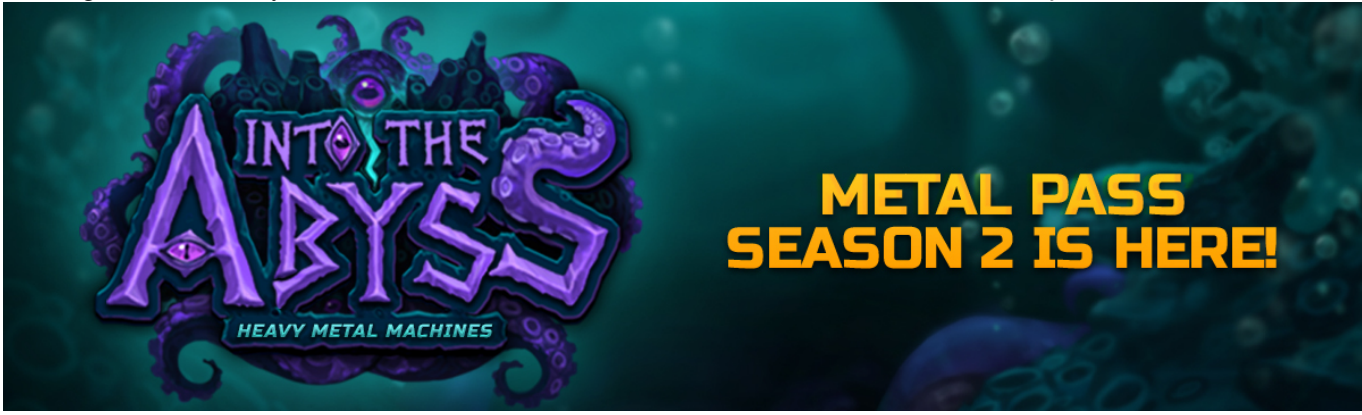
22 All aboard the Heavy Metal Submarine! 22

Greeting SOF Community!. New Metal Pass Season is Here! More than 90 NEW rewards for you!: